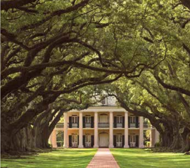
Oak Alley Plantation.