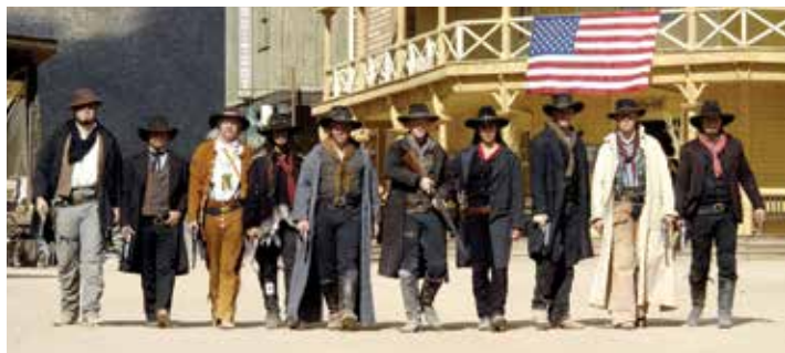
Gunfight at Tombstone, Arizona.