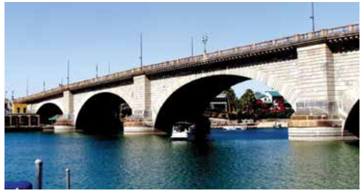
London Bridge in Lake Havasu City.

INCLUDED IN YOUR HOLIDAY: •First class transportation on an air-conditioned, washroom-equipped motorcoach •Quality accommodation and tax •Services of an experienced Tour Director and Driver •Baggage handling, one average piece per person •Travel Bag •Admission to attractions and sightseeing as outlined in the itinerary •Welcome Meet and Greet •Las Vegas Driving Tour of Strip •Fremont Street Experience •Oatman •London Bridge •Presidio San Agustin del Tucson •Guided Tour of Tucson •Old Tucson Studios •Arizona Sonora Desert Museum •Tombstone •Gunfight at O.K. Corral •Boot Hill Cemetery •Guided Tour of Phoenix area •Free Day in Phoenix •Montezuma Castle National Monument •Sedona •Oak Creek Canyon •IMAX Theatre •Grand Canyon National Park •Dinner in Kayenta •Guided tour of Monument Valley Navajo Tribal Park •Four Corners Monument •Lake Powell •Glen Canyon National Recreation Area •Glen Canyon Dam •Bryce Canyon National Park •Zion National Park •Farewell Dinner •15 Meals Include: 13 Breakfasts and 2 Dinners.