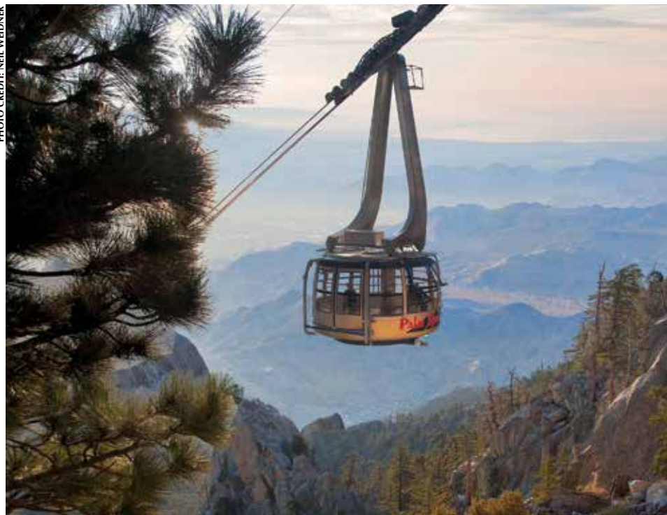
Palm Springs Aerial Tramway.