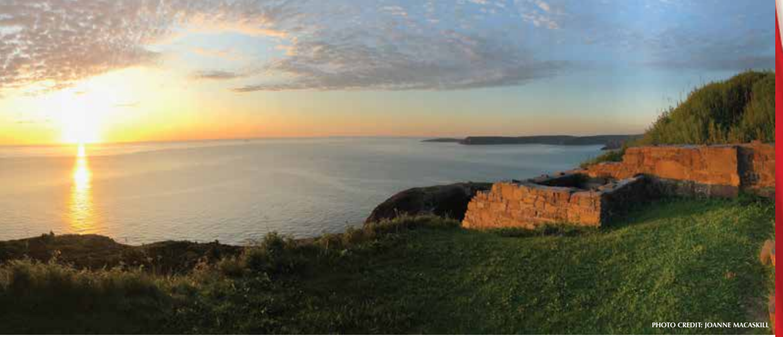
Sunrise at Signal Hill.