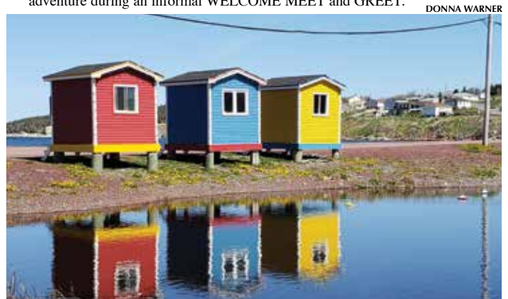
Fishing Stages Cavendish, Newfoundland/Labrador.

1 HOME CITIES to DEER LAKE to ROCKY HARBOUR/COW HEAD: (2 nights) Begin your "Tour of the Rock" as you arrive in Deer Lake on the West Coast of Newfoundland. An AIRPORT TRANSFER will be provided to your hotel in Rocky Harbour/Cow Head. While enroute travel the VIKING TRAIL to take in the spectacular scenery of Gros Morne National Park, an area declared by the United Nations as the newest World Heritage Site. The evening offers an opportunity to meet your fellow travellers and learn details of your upcoming adventure during an informal WELCOME MEET and GREET.