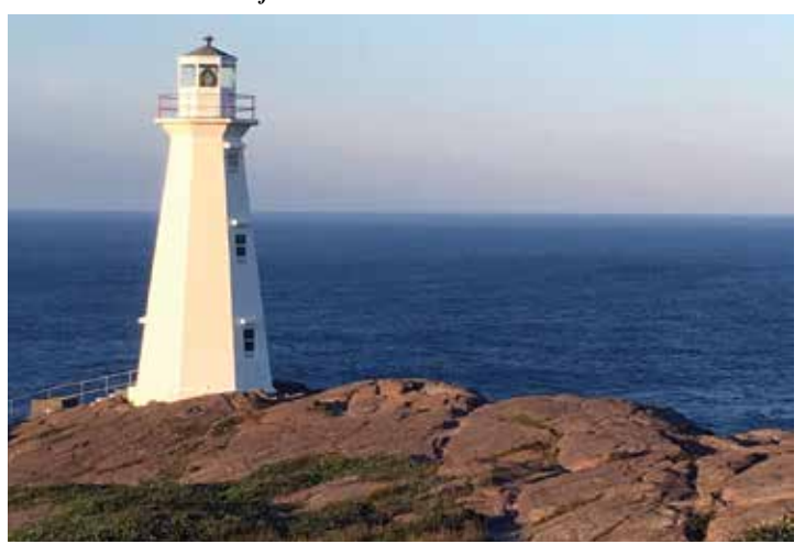
Cape Spear National Historic Park.

9 ST. JOHN'S to HOME CITIES: All good things must come to an end and so we bid a fond farewell to our newest yet oldest province. Fly home with many delightful memories of an authentic Newfoundland experience to be recalled for years to come. AIRPORT TRANSFER is provided. Meals Include: Breakfast.