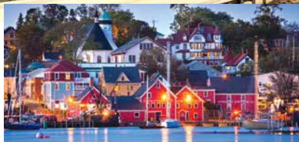
Lunenburg, Nova Scotia.

Combine the power of Niagara Falls and the sophistication of Toronto. Gananoque is your gateway to the awesome scenery of the 1000 Islands area. Experience the charm of Quebec City and sample the rugged beauty and cultural heritage of the Maritimes. See autumn explode with breathtaking scenery and colours while travelling through New Brunswick, Prince Edward Island and Nova Scotia. Let the history of Montreal and the beauty of Ottawa entice you before returning home from Ottawa.