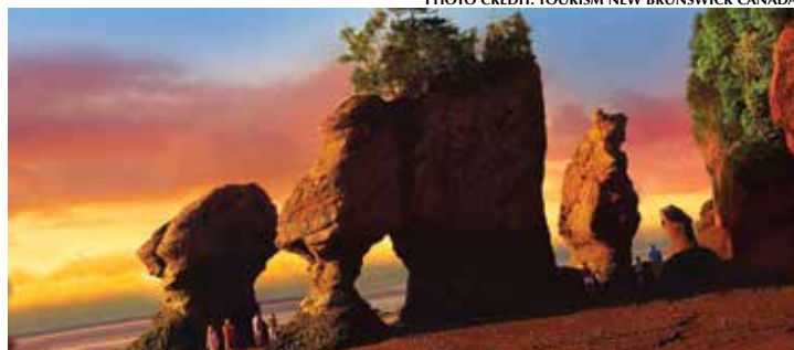
Hopewell Rocks, New Brunswick.

INCLUDED IN YOUR HOLIDAY: •Airport Transfers Day 1 and Day 20 (if air travel is arranged prior to, or after tour dates – cost of transfer is at passenger's expense) •First class transportation on an air-conditioned, washroom-equipped motorcoach •Quality accommodation and tax •Services of an experienced Tour Director and Driver •Baggage Handling, one average piece per person •Admission to attractions and sightseeing as outlined in the itinerary •Ferry crossings as indicated •Welcome Meet and Greet •Welland Canal Lock 3 •Niagara-on-the-Lake •Winery •Niagara City Cruises •CN Tower •1000 Islands Boat Cruise •Sugar Shack •Chez Marie •Ste-Anne-de-Beaupre •Canyon Ste-Anne •Magnetic Hill •World's largest lobster •Confederation Bridge •Lobster Dinner •Green Gables Heritage Place •Cavendish Beach •Free day in Charlottetown •Alexander Graham Bell Museum •Cabot Trail •Picnic Lunch •Cape Breton Highlands •Lunenburg •Peggy's Cove and Fish n'Chips •Pier 21 or The Citadel •Anne Murray Centre •Hopewell Cape •Fundy National Park •Reversing Rapids •St. Andrews by the Sea •King's Landing •Hartland Covered Bridge •Saint-Jean-Port-Joli •Montreal Old Port •Mont Royal •Guided tour of Parliament •Farewell Dinner •Locally Guided City Tours as outlined in the itinerary: Toronto, Quebec City, Charlottetown, Halifax, Ottawa. •21 Meals Include: 13 Breakfasts, 2 Lunches, 6 Dinners.