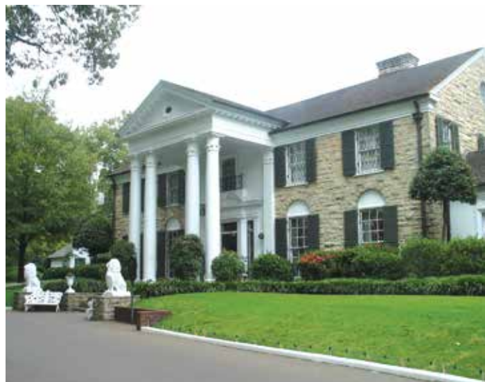
Graceland, Memphis, Tennessee.