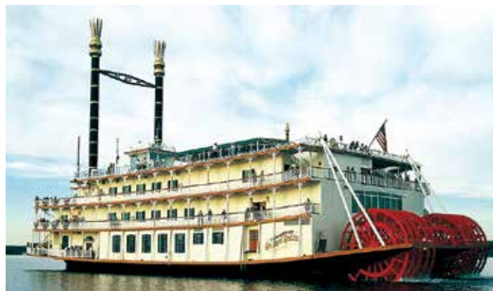
Showboat Branson Belle.