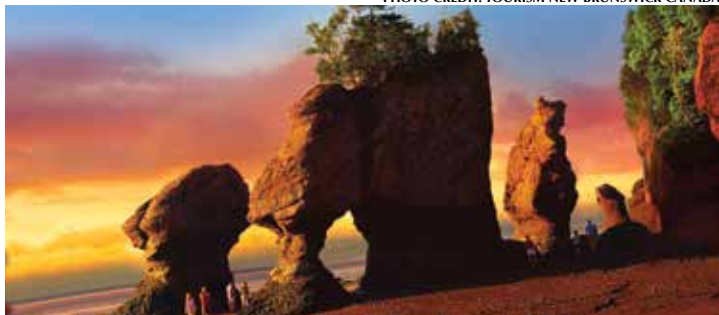
Hopewell Rocks, New Brunswick.

DEPARTURE DATES 2025 20 Days: September 11 PRICES TO BE ANNOUNCED