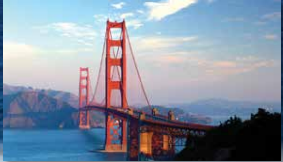
San Francisco's historic Golden Gate Bridge.

of Twin Peaks. Arrive PIER 39 in time for lunch, browsing time and a one-hour San Francisco BAY CRUISE. The rest of the day is yours to enjoy in this fascinating city. Return to your hotel for overnight.