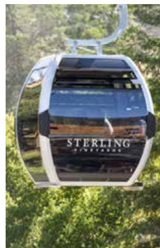
Sterling Winery Aerial Gondola.