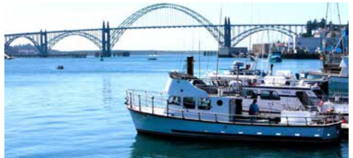
Newport's Historic Bayfront.

13 CRANBROOK to CALGARY to EDMONTON: Sunday. Return home with new-found friends and fond memories of your holiday.