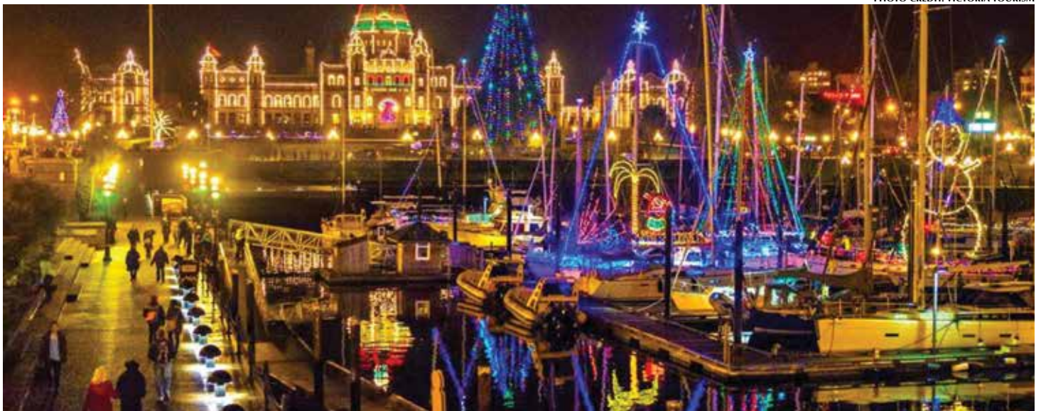
Inner Harbour Sailboats.

INCLUDED IN YOUR HOLIDAY: •First class transportation on an air-conditioned, washroom-equipped motorcoach •Quality accommodation and tax •Services of an experienced Tour Director and Driver •Baggage handling, one average piece per person •Travel Bag •Admission to attractions and sightseeing as outlined in the itinerary •Welcome Dinner •Ferry crossings as indicated •Guided tour of Victoria •Christmas Eve Dinner •Christmas Brunch •Visit from Santa •Christmas Gift •Christmas Dinner •Butterfly Gardens •Butchart Gardens lit up for Christmas •Afternoon High Tea •Pizza Party •Farewell Dinner •14 Meals include: 7 Breakfasts, 1 Brunch, 1 Afternoon High Tea, 5 Dinners.