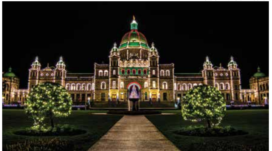
British Columbia Legislative Building.

DEPARTURE DATES 2025 9 Days: December 21 PRICES TO BE ANNOUNCED