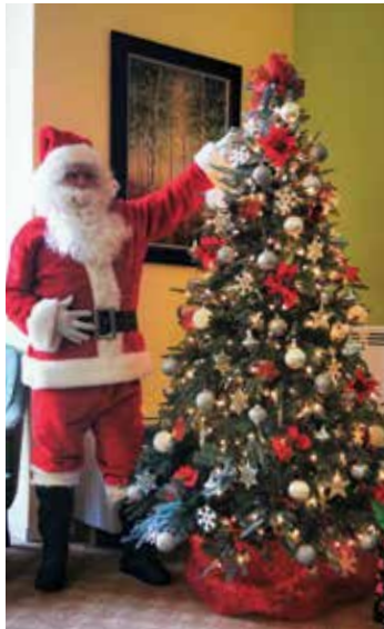
A visit from Santa.

9 HINTON to EDMONTON to CALGARY: Monday, December 29. Return home from a most memorable Christmas Holiday. Make a stop in Edmonton before the tour concludes in Calgary.