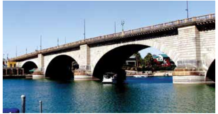
London Bridge in Lake Havasu City.

INCLUDED IN YOUR HOLIDAY: •First class transportation on an air-conditioned, washroom-equipped motorcoach •Quality accommodation and tax •Services of an experienced Tour Director and Driver •Baggage handling, one average piece per person •Travel Bag •Admission to attractions and sightseeing as outlined in the itinerary •Welcome Meet and Greet •Las Vegas Driving Tour of Strip •Fremont Street Experience •Oatman •London Bridge •Presidio San Agustin del Tucson •Guided Tour of Tucson •Old Tucson Studios •Arizona Sonora Desert Museum •Tombstone •Gunfight at O.K. Corral •Bisbee •Boot Hill Cemetery •Guided Tour of Phoenix area •Free Day in Phoenix •Montezuma Castle National Monument •Sedona •Oak Creek Canyon •IMAX Theatre •Grand Canyon National Park •Dinner in Kayenta •Guided tour of Monument Valley Navajo Tribal Park •Four Corners Monument •Lake Powell •Glen Canyon National Recreation Area •Glen Canyon Dam •Bryce Canyon National Park •Zion National Park •Farewell Dinner •15 Meals Include: 13 Breakfasts and 2 Dinners.