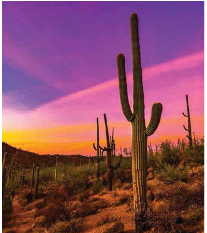
Saguaro National Park, Tucson.