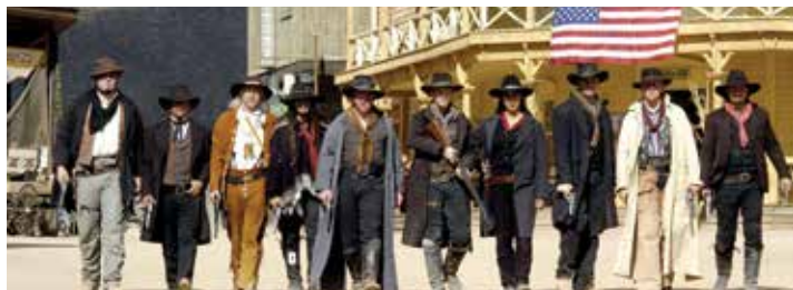
Gunfight at Tombstone, Arizona.