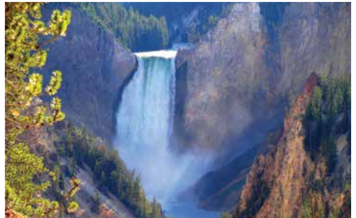
Grand Canyon Falls, Yellowstone National Park.

6 DEADWOOD to BLACK HILLS to DEADWOOD: Thursday. This morning travel through the BLACK HILLS NATIONAL FOREST to visit two of the world's largest mountain carvings. Ride the Black Hills Central Railroad 1880 TRAIN, an authentically restored steam engine that transports you back in time, on your way to the MOUNT RUSHMORE NATIONAL MEMORIAL. Afterwards, travel by motorcoach to the CRAZY HORSE MEMORIAL and return to Deadwood for overnight.