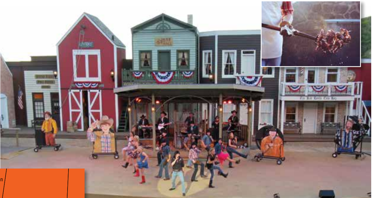
Medora Musical, Medora, North Dakota.