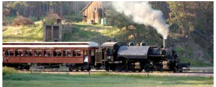
Ride the 1880 train.