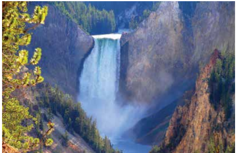
Grand Canyon Falls, Yellowstone National Park.

6 DEADWOOD to BLACK HILLS to DEADWOOD: Thursday. This morning travel through the BLACK HILLS NATIONAL FOREST to visit two of the world's largest mountain carvings. Ride the Black Hills Central Railroad 1880 TRAIN, an authentically restored steam engine that transports you back in time, on your way to the MOUNT RUSHMORE NATIONAL MEMORIAL. Afterwards, travel by motorcoach to the