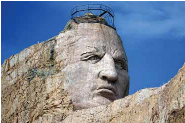
Crazy Horse Memorial.

9 SWIFT CURRENT to CALGARY to EDMONTON: Sunday. Today is "Going Home" day with many memories of your scenic tour.