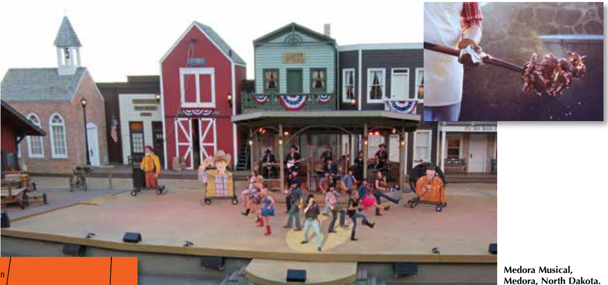
Medora Musical, Medora, North Dakota.