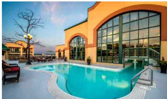
Temple Gardens Hotel and Spa.

DON'T FORGET YOUR SWIMSUIT! ROBES ARE PROVIDED AT BOTH SPAS. For more information on booking spa services, enquire at time of booking.