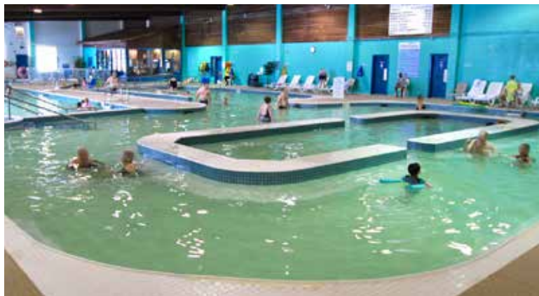
Manitou Springs Resort and Mineral Spa.