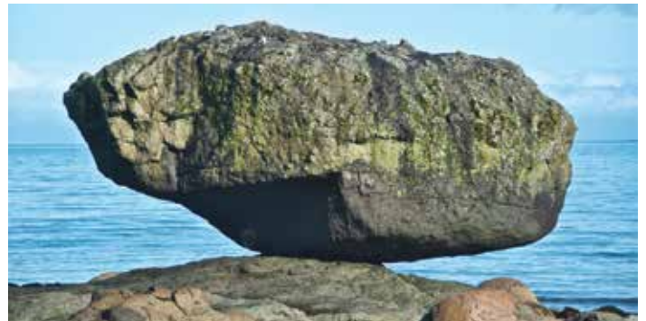
Balance Rock at Skidegate.

boardwalk. Travel a short distance to overnight at the Best Western Terrace Inn . Share memories with fellow travellers at a HOSTED FAREWELL DINNER.