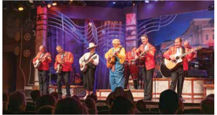
Presleys Country Jubilee.