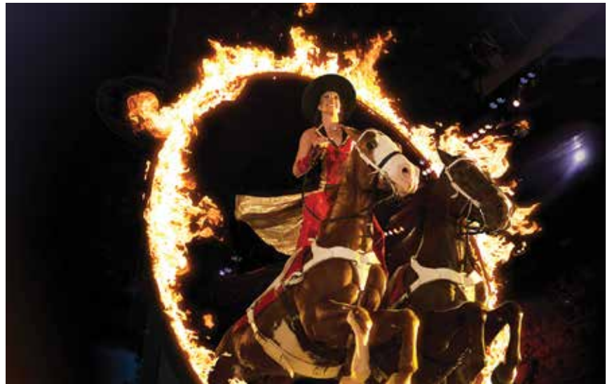
Dolly Parton's Stampede.

INCLUDED IN YOUR HOLIDAY: •First class transportation on an air-conditioned, washroom-equipped motorcoach •Quality accommodation and tax •Services of an experienced Tour Director and Driver •Baggage handling, one average piece per person •Travel Bag •Admission to attractions and sightseeing as outlined in the itinerary •Welcome Meet and Greet •Pizza Party •Fantastic Caverns •Six live music shows in Branson which includes a dinner cruise and show •Performance schedules may be subject to change •Silver Dollar City Theme Park •Tree Lighting Ceremony •College of the Ozarks •Branson Landing •McFarlain's Family Restaurant •Lights of Joy Christmas Drive-Thru •Mall of America •Farewell Dinner •Meals Include: All Breakfasts, 1 Lunch, 5 Dinners.