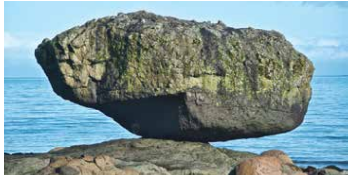
Balance Rock at Skidegate.