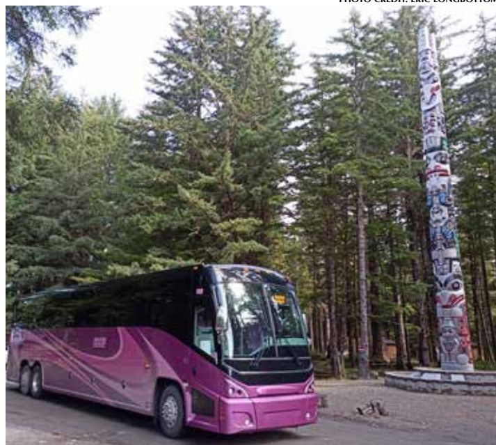
The Solstice Pole, Hiellen.

before continuing to Prince Rupert, the gateway to BC’s beautiful north coast. Settle in at the friendly Inn on the Harbour .