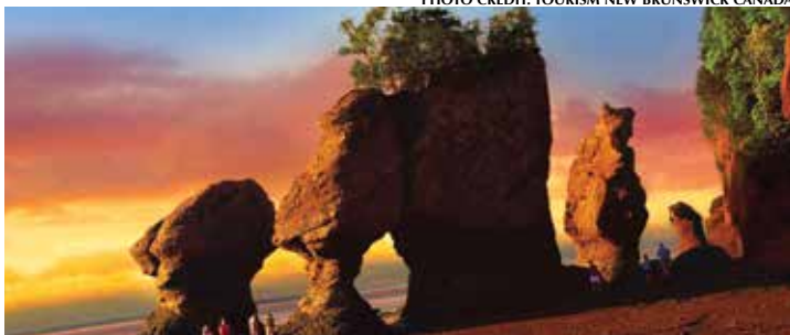
Hopewell Rocks, New Brunswick.