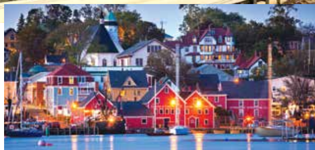
Lunenburg, Nova Scotia.

Combine the power of Niagara Falls and the sophistication of Toronto. Gananoque is your gateway to the awesome scenery of the 1000 Islands area. Experience the charm of Quebec City and sample the rugged beauty and cultural heritage of the Maritimes. See autumn explode with breathtaking scenery and colours while travelling through New Brunswick, Prince Edward Island and Nova Scotia. Let the history of Montreal and the beauty of Ottawa entice you before returning home from Ottawa.