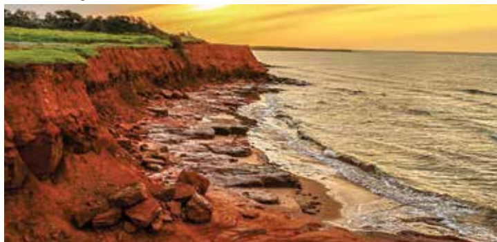
Prince Edward Island.