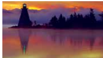
Baddeck, Nova Scotia.