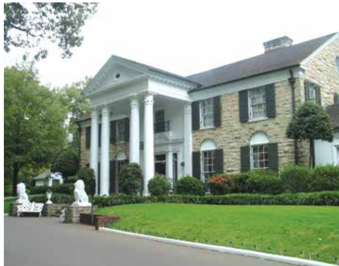
Graceland, Memphis, Tennessee.