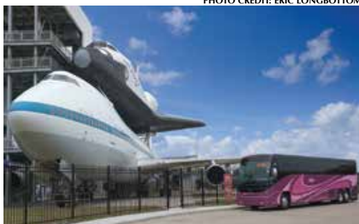
Space Center Houston.

21 22 DEADWOOD to WILLISTON: Monday . Leave Deadwood mid-morning and travel through the lonesome plains of South Dakota. Enter North Dakota, continuing your travels through the North Dakota Badlands to Williston for overnight. Share tour memories tonight with your fellow travellers at a HOSTED FAREWELL DINNER .