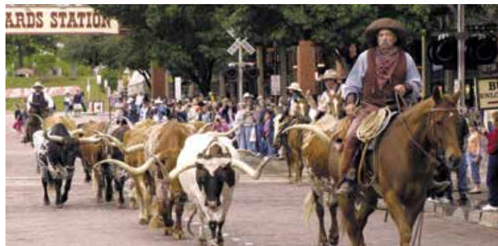
Fort Worth Stockyards cattle drive.

16 17 NEW ORLEANS to MEMPHIS: (2 nights) Wednesday . Depart from the "Jazz Capital of the World" and pass through Mississippi, the "Birthplace of The Blues". Continue to Memphis, Tennessee, home of Graceland and "The Birthplace of Rock n' Roll". Your two -night stay is at The Guest House at Graceland , steps away from the iconic Graceland Mansion.