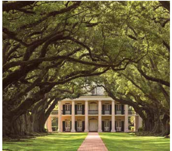
Oak Alley Plantation.