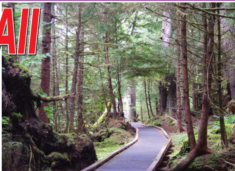
Tow Hill walking trail.