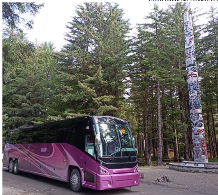
The Solstice Pole, Hiellen.

before continuing to Prince Rupert, the gateway to BC’s beautiful north coast. Settle in at the friendly Inn on the Harbour .