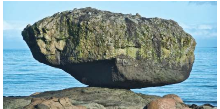
Balance Rock at Skidegate.