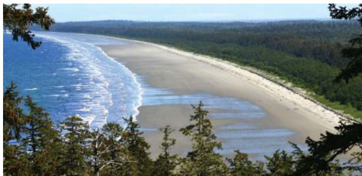
Haida Gwaii beach.