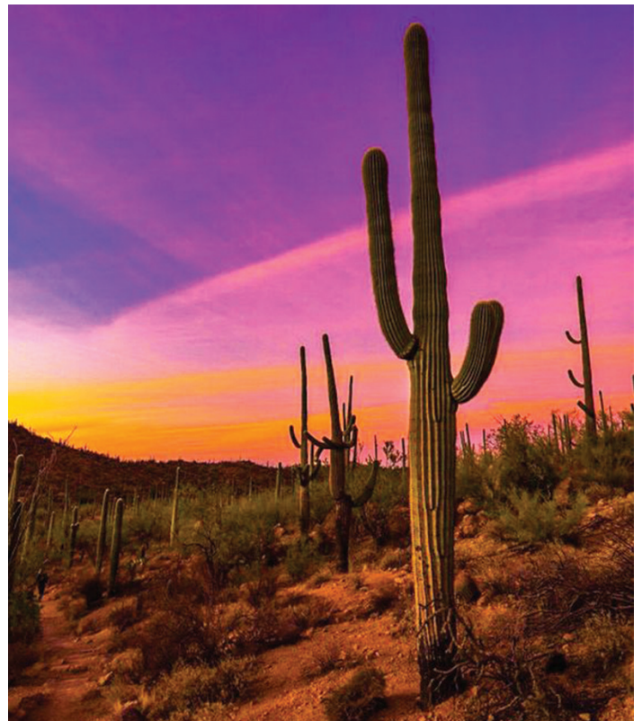
Saguaro National Park, Tucson.