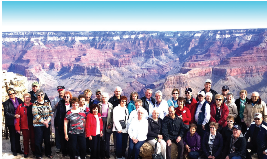
Grand Canyon, Arizona.