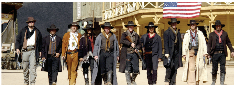
Gunfight at Tombstone, Arizona.