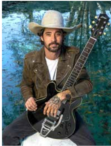
2024 Entertainer Ryan Bingham.

in Third Class"). This laid the groundwork for a career that would eventually find them topping the Billboard World Chart six times, making appearances at mainstream music festivals, and regularly headlining the largest Irish Festivals across the country. The Texas Tenors have amassed a huge fan base and were Billboard Magazine's #10 Classical Artist in the World for 2019. After airing worldwide on America's Got Talent their fan base grew even larger and the mass appeal of these three friends is undeniable! You will hear new music - everything from Country to Classical!