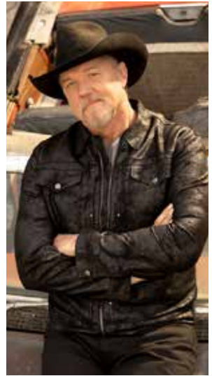
2024 Entertainer Trace Adkins.

7:00 p.m. included show RYAN BINGHAM. The singer-songwriter and guitarist has released six studio albums and one live album. Since 2018, Bingham has had a guest role in the hit TV show, "Yellowstone", as Walker, a nomadic guitar-playing ranch hand.