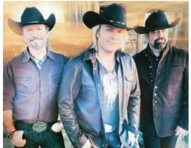
2024 Entertainers The Texas Tenors.