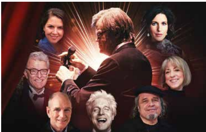
2024 Entertainers A Prairie Home Companion.

7:00 p.m. included show TRACE ADKINS. Since his debut in 1996, the larger-than-life star has sold over 11 million albums and charted 20 songs on Billboard's all genre Hot 100, while catapulting 15 singles into the Top 10 on Billboard's Hot Country Songs chart. He has also racked up two billion streams and boasts a reputation for fiery live performances – not to mention his multiple Grammy nominations, awards from the ACM and CMT, and a willingness to think outside the box.