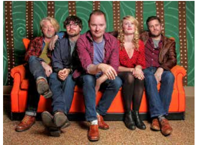
2024 Entertainers Gaelic Storm.