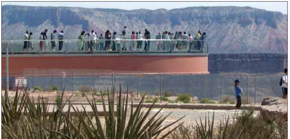
Skywalk Glass Bridge – Grand Canyon West, Arizona.