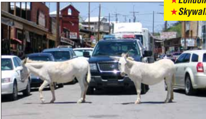
Burros roam the streets in Oatman, Arizona.

7 LAUGHLIN to MESQUITE: Thursday. Bid farewell to Laughlin. Make a brief stop in Las Vegas with time to experience THE STRIP and have lunch. Continue to Mesquite, Nevada, set in a tranquil valley that is framed by the picturesque Virgin Mountains.