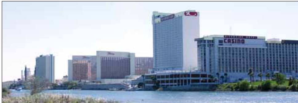
Colorado River and Laughlin skyline.

INCLUDED IN YOUR HOLIDAY: •First class transportation on an air-conditioned, washroom-equipped motorcoach •Standard accommodations and taxes Services of an experienced Tour Director and Driver •Baggage handling, one average piece per person •Travel Bag •Admissions for all attractions and sightseeing as outlined in the itinerary •Lake Havasu City •London Bridge •Route 66 •Oatman •Grand Canyon West •The Las Vegas Strip •Virgin River Canyon •Driving tour around Mormon Tabernacle Square •Farewell Reception •1 Buffet.