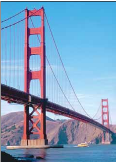
San Francisco's historic Golden Gate Bridge.

INCLUDED IN YOUR HOLIDAY: •First class transportation on an air-conditioned, washroom-equipped motorcoach. •Standard accommodations and taxes •Services of an experienced Tour Director and Driver •Baggage handling, one average piece per person •Travel Bag •Admissions for all attractions and sightseeing as outlined in the itinerary •Redwood National Park •Avenue of the Giants •Wine Tasting •Bay Cruise •Guided tour of San Francisco •Cable Car Ride •Pier 39 •7 Meals: 5 Continental Breakfasts, 1 Picnic Lunch and a Farewell Dinner.