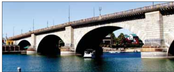
London Bridge in Lake Havasu City.

INCLUDED IN YOUR HOLIDAY: •First class transportation on an air-conditioned, washroom-equipped motorcoach •Standard accommodations and taxes •Services of an experienced Tour Director and Driver •Baggage handling, one average piece per person •Travel Bag •Admissions for all attractions and sightseeing as outlined in the itinerary •Welcome Reception •Las Vegas Night-Light Tour and The Strip •Fremont Experience •London Bridge National Monument •Mission San Xavier Del Bac •Guided Tour of Historical Tucson •Old Tucson Studios •Arizona Sonora Desert Museum •Bisbee •Tombstone •Gunfight at O.K. Corral •Boothill Cemetery •Orange Patch •Guided Tour of Phoenix area •Barleen's Arizona Opry Dinner and Show •Montezuma Castle National Monument •Sedona •Oak Creek Canyon •Imax Theatre •Grand Canyon •Lake Powell •Zion National Park •Farewell dinner •4 Continental Breakfasts.