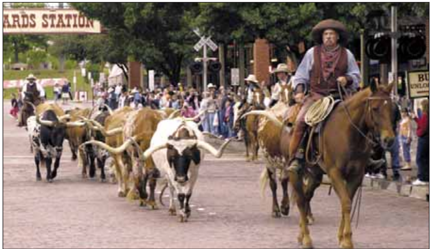
Fort Worth Stockyards cattle drive.

18 19 MEMPHIS to KANSAS CITY: Friday. Depart Tennessee and head north to Kansas City, Missouri, home of Hallmark the world's largest greeting card manufacturer.