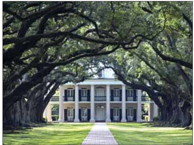
Oak Alley Plantation.