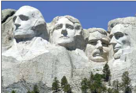
Mount Rushmore National Memorial, South Dakota.

15 16 NEW ORLEANS: Tuesday. A CITY TOUR details the landmarks, legends and architecture that made the "Crescent City" famous. In the afternoon enjoy a NARRATED CRUISE on the Sternwheeler Natchez. You will have an opportunity to explore the charm of the French Quarter's narrow streets, quaint courtyards and sidewalk cafes.