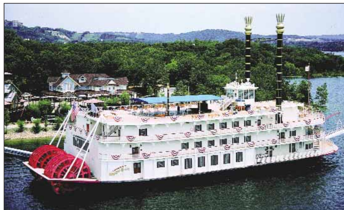
Showboat Branson Belle.

DEPARTURE: Edmonton 7:00 a.m., Red Deer 9:00 a.m., Calgary 12:00 p.m., Fort Macleod 1:45 p.m., Lethbridge 2:30 p.m., Medicine Hat 4:15 p.m.