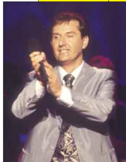
Daniel O'Donnell: Ireland's greatest export.

CEREMONY in the Square and marvel at the spectacular light and sound show. Browse in the many craft shops and enjoy a wide variety of live musical entertainment.