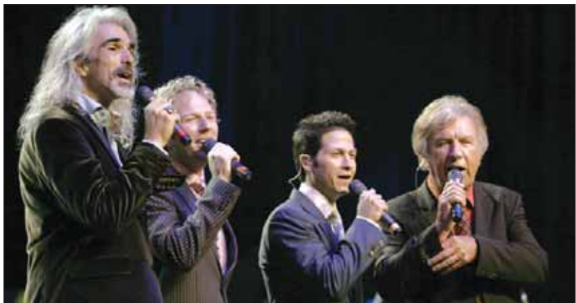
Gaither Vocal Band.