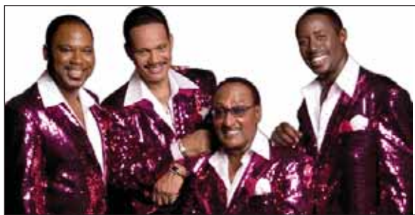
The Four Tops.