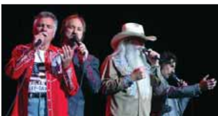
Oak Ridge Boys.

8 SWIFT CURRENT to CALGARY to EDMONTON: Monday. Return home with fond memories of your Concert Tour.