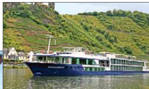
Avalon Affinity river cruise vessel.

Cologne and the Germano-Roman Museum next to the cathedral is a must for history buffs! Meals included: breakfast, lunch, dinner.